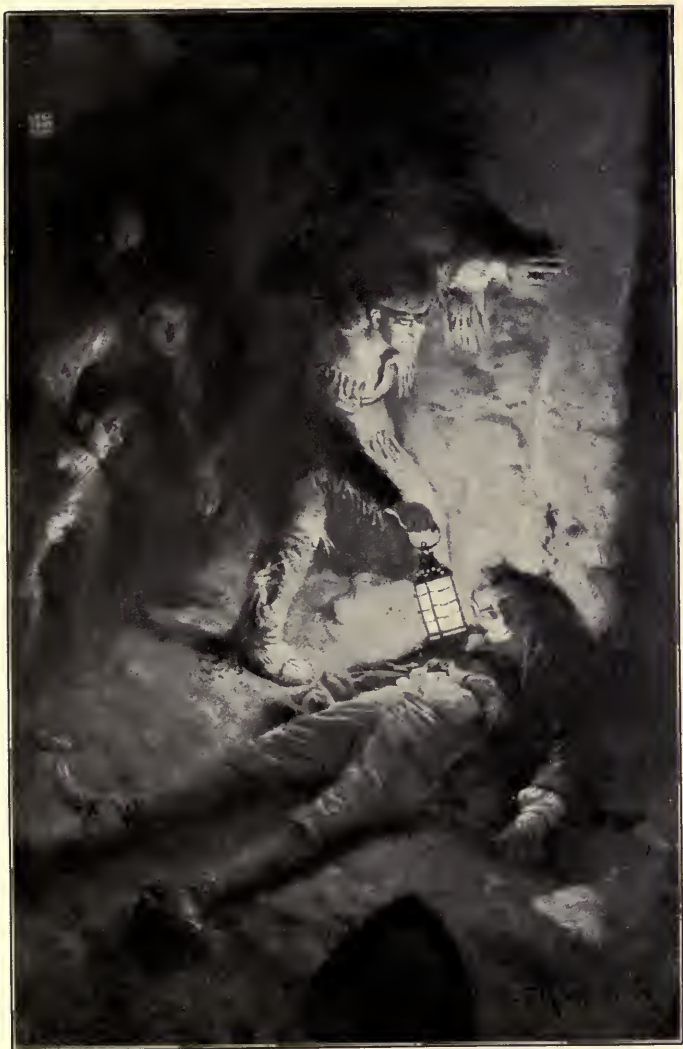
“GREATHOUSE,” WHISPERED MOUNT”